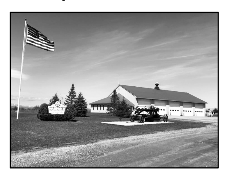
Town Garage in April 2020.