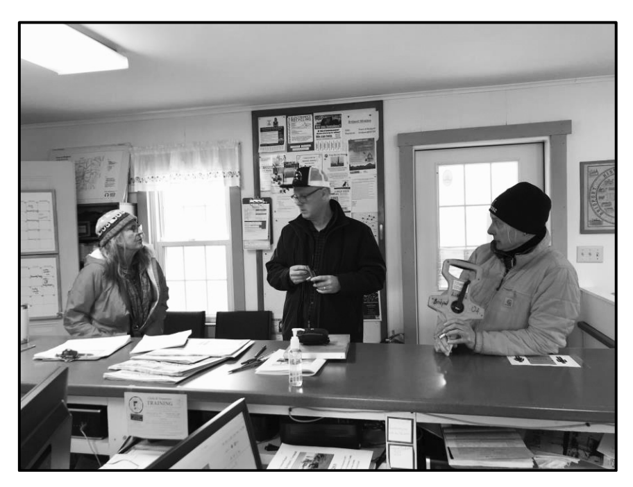
Bridport Listers, March 2020