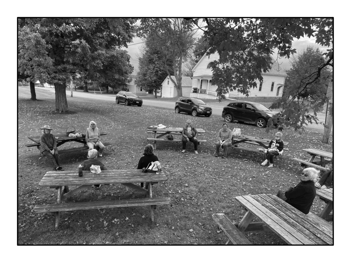
Bridport Defense League Bone Builders physically distanced exercise on the Town Green 2020.