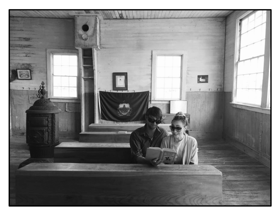
In the Hawthorne Schoolhouse, August 2020