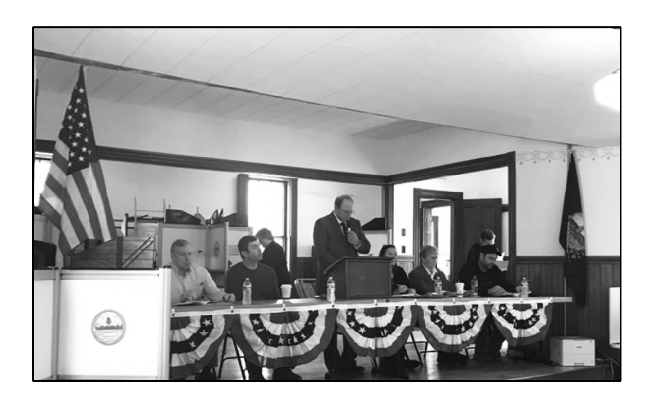
Bridport Town Meeting March 3, 2020